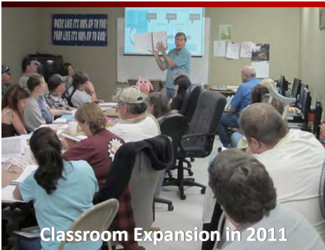
Classroom Expansion in 2011

Because of your donations, we have new computers, new classrooms, new programs – all aimed at helping others break the cycle of poverty. We could not do this work without your gifts and most especially your prayers of support. Maybe you work and don't have the time to come here and volunteer but you give – thank you.